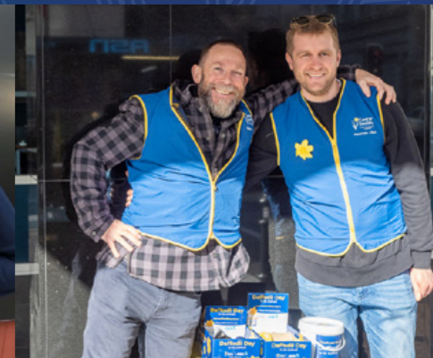
Uniting for a Cause: Friends join forces in collecting for Daffodil Day, standing strong in support of cancer patients and their families.