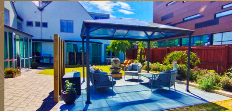
Mitre 10 MEGA Dunedin's Helping Hands initiative brings solace to cancer patients staying at Daffodil House.

The momentum of our supportive care services continues to surge forward. The collective expertise of our dedicated staff, known as "kamahi," across supportive care, transport assistance, and accommodation adds substantial depth to the support available to our patients and their whānau.