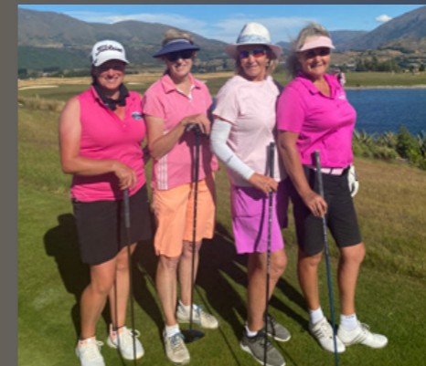
Pink Ladies teeing off with enthusiasm at the Cancer Society's The Longest Day Golf Tournament.

This activity, alongside our regular donors, our successful Daffodil Day campaign, our 42 grant funders, our 46 Local Hero Business partners, event sponsors and community fundraisers all contributed to our income. We do not receive any government funding so this truly is the difference of us being able to do what we do – or not. We would also like to extend our heartfelt gratitude to those who have passed and left us a legacy in their will.