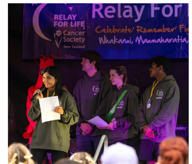
Youth empowerment: The vibrant Relay For Life Students Committee takes the stage with passion and purpose.